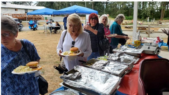
What an awesome event – thank you Chapter One!!!