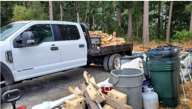
And thank you to the many who have helped!!!