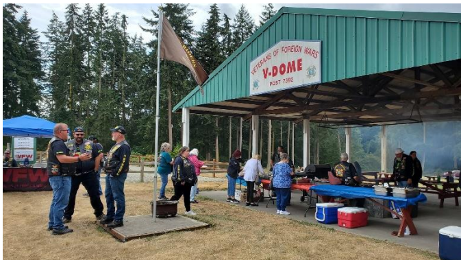
Our V-Dome in use – awesome!!!