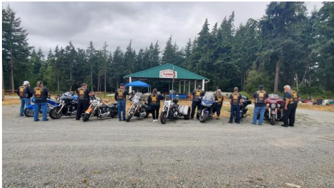
VFW Riders Chapter One