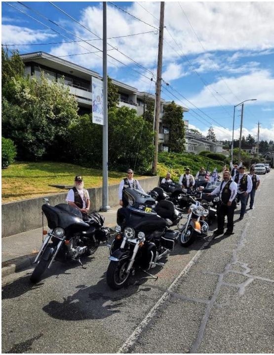
VFW Chapter One Riders were present!!!